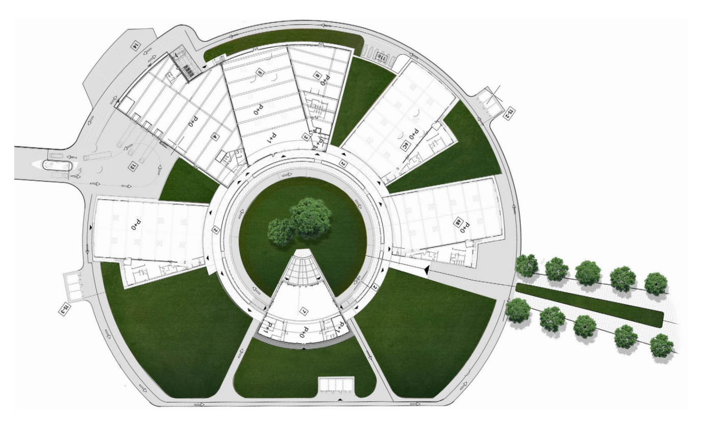
Industrial complex Sombor STRUCTURA CONCEPT®